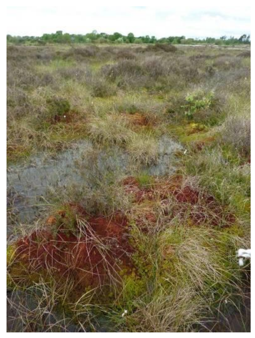
Figure 2.2 Water table at the surface of cutover bog following successful drain blocking resulting in Sphagnum development less than 10 years after drain blocking (this was previously an area of bare peat)