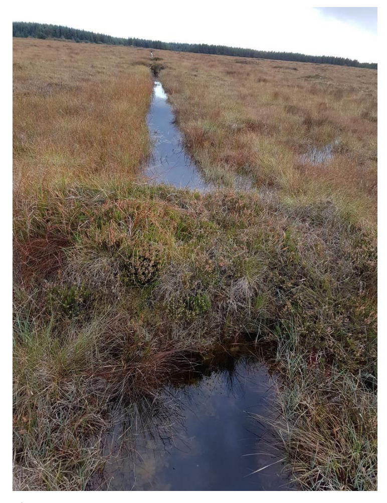
Figure 2.1 Example of a peat dam to block a typical high bog drain