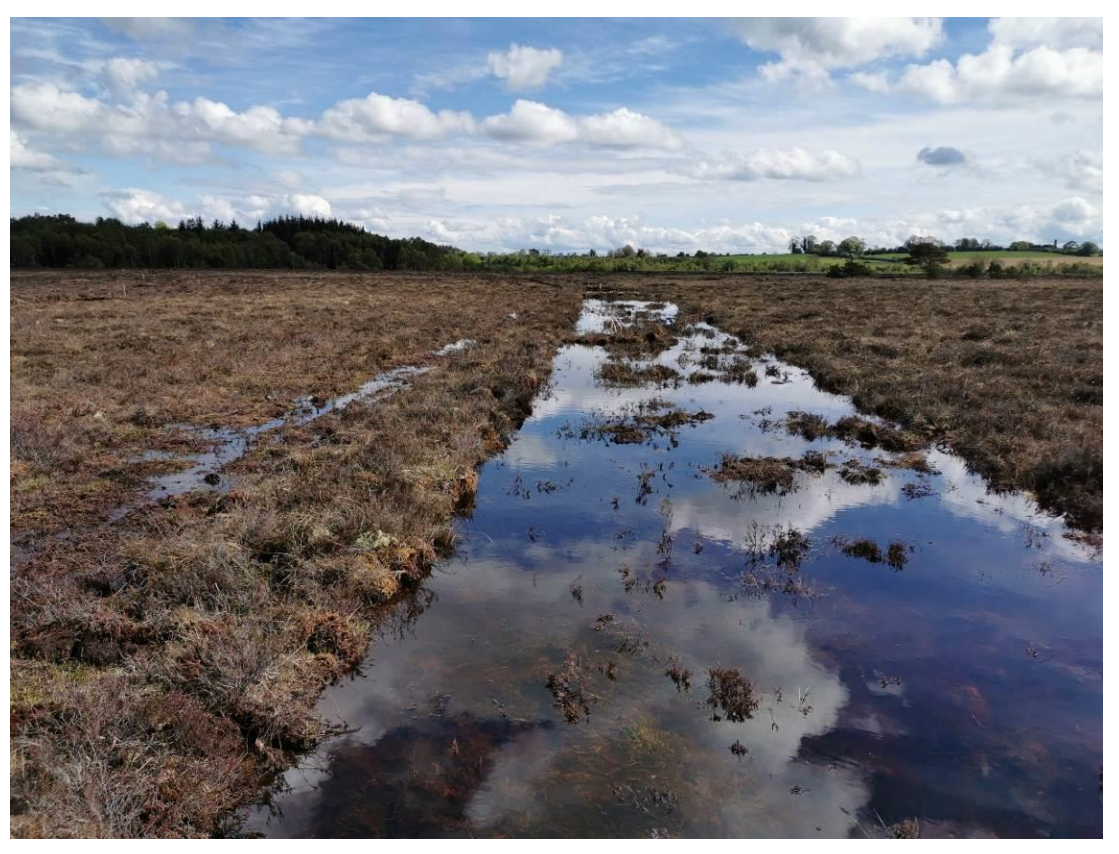
Figure 2.3 Contour bund constructed at Knockacoller Bog SAC, Co. Laois

Contour bunds are most effective where there is cracking or slumping in the upper layers of the peat as the re-compacted trench assists in sealing up these cracks and slows the flow rate through the peat, supporting a higher water table behind the bund. The key issue with this technique is that the extent of the impact extending back into the bog depends on the hydraulic gradient (which is closely correlated to surface slope). As a result, the extent of impact from such bunds is likely to be extremely limited where the surface slope at the margins is steep. This method is best suited to sites with a relatively gentle slope towards the margins or as a means of effectively blocking a dense network of shallow surface drains on the high bog. Ground conditions will play an important factor in whether the bund can be constructed in such circumstances, therefore this method is most effective on drier sites where machines can operate safely and effectively.