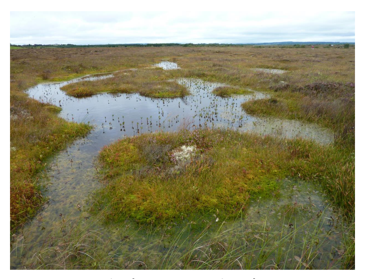
Raised Bog Restoration Plan