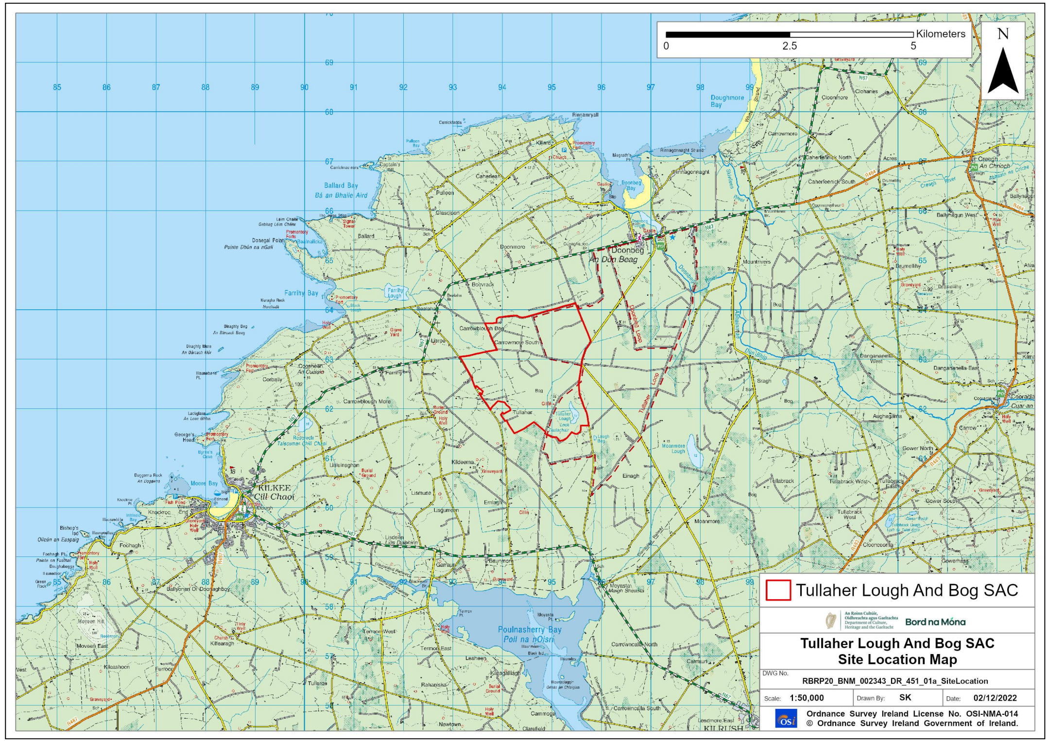
Map 1 - Tullaher Lough and Bog SAC Boundary