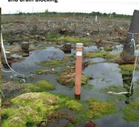
Figure 2.4 Example of the impact of felling forestry on a raised bog to restore more natural hydrological conditions

There are coniferous forestry plantations on the high bog and cutover at Tullaghanrock Bog SAC. It is proposed that forests considered to be having an impact on the hydrology of the high bog will be felled. Details of the locations of forestry proposed for felling can be found in Map 3.