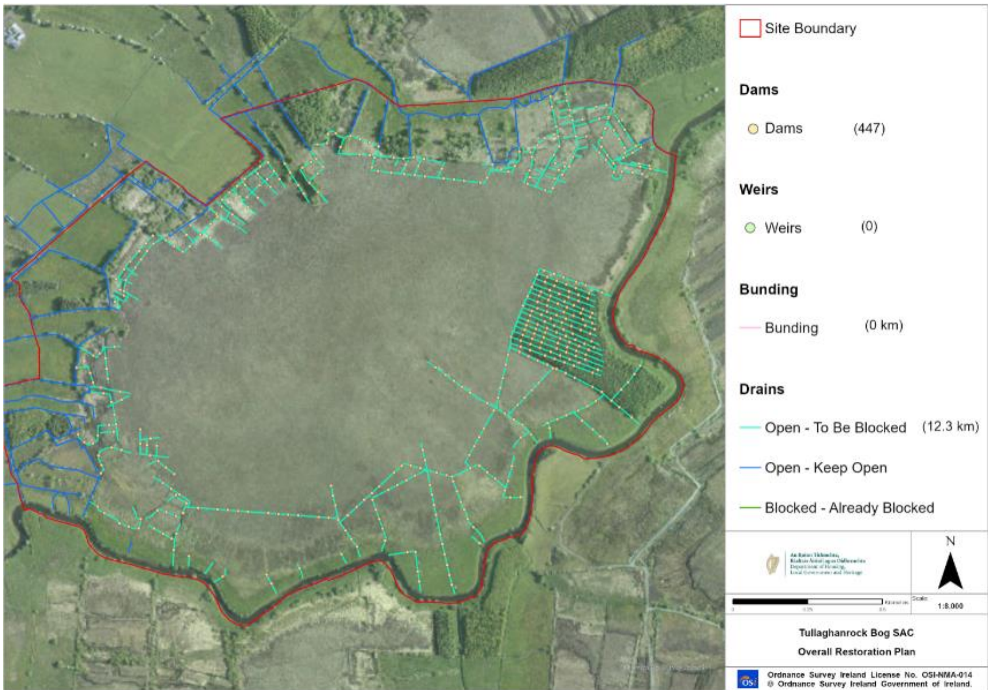
Map 2 - Tullaghanrock Bog SAC Restoration Proposals