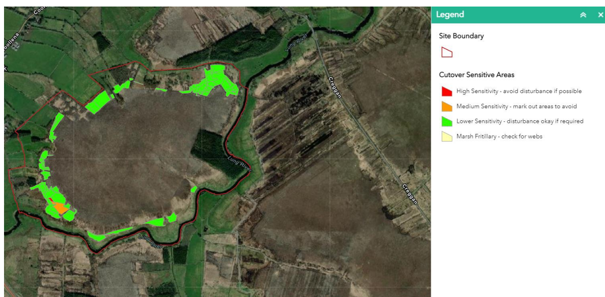
Figure 5.1 Sensitive habitats mapped at Tullaghanrock Bog SAC

In addition to the high bog survey, a cutover habitat survey was carried out in 2023 in accordance with Irish Wildlife Manual No. 128 'The Habitats of Cutover Raised Bog' (Smith & Crowley, 2020). This survey involved detailed mapping of the various vegetation communities occurring on the cutover bog and classified these in terms of sensitivity to damage from restoration activities. Although most areas were found to be of negligible or lower sensitivity, there were small pockets of medium and high sensitivity vegetation, particularly towards the north of the bog. This mapping together with mapping of the high bog ensures the restoration plan takes into account the existing sensitive habitats present on site to minimise potential impacts.