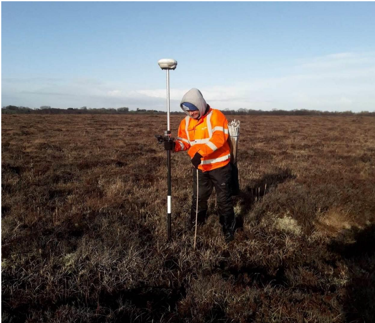
Figure 5.2 Example of setting out dams on an area of high bog

measures in detail on the ground and where necessary minor modifications can be made (e.g., adjusting the placement of particular dams due to dense vegetation coverage or alignment of bunds due to ground conditions). This ensure that the risk of damage to the raised bog is minimized as inadequate planning can increase the risk of machines entering unsuitable areas.