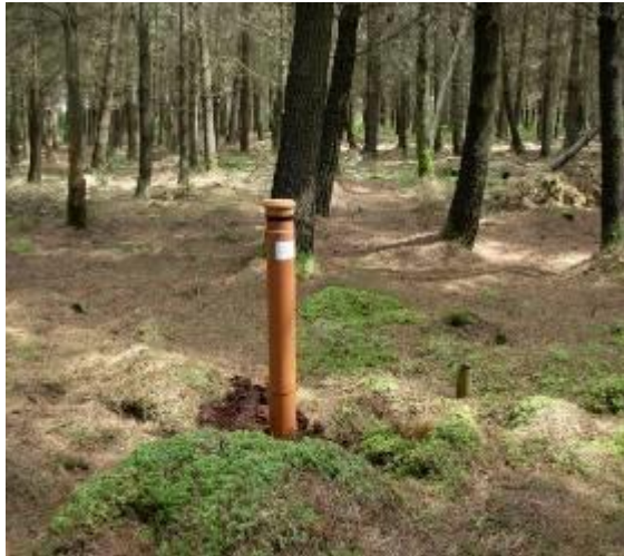
a) Bog surface prior to forestry removal and drain blocking