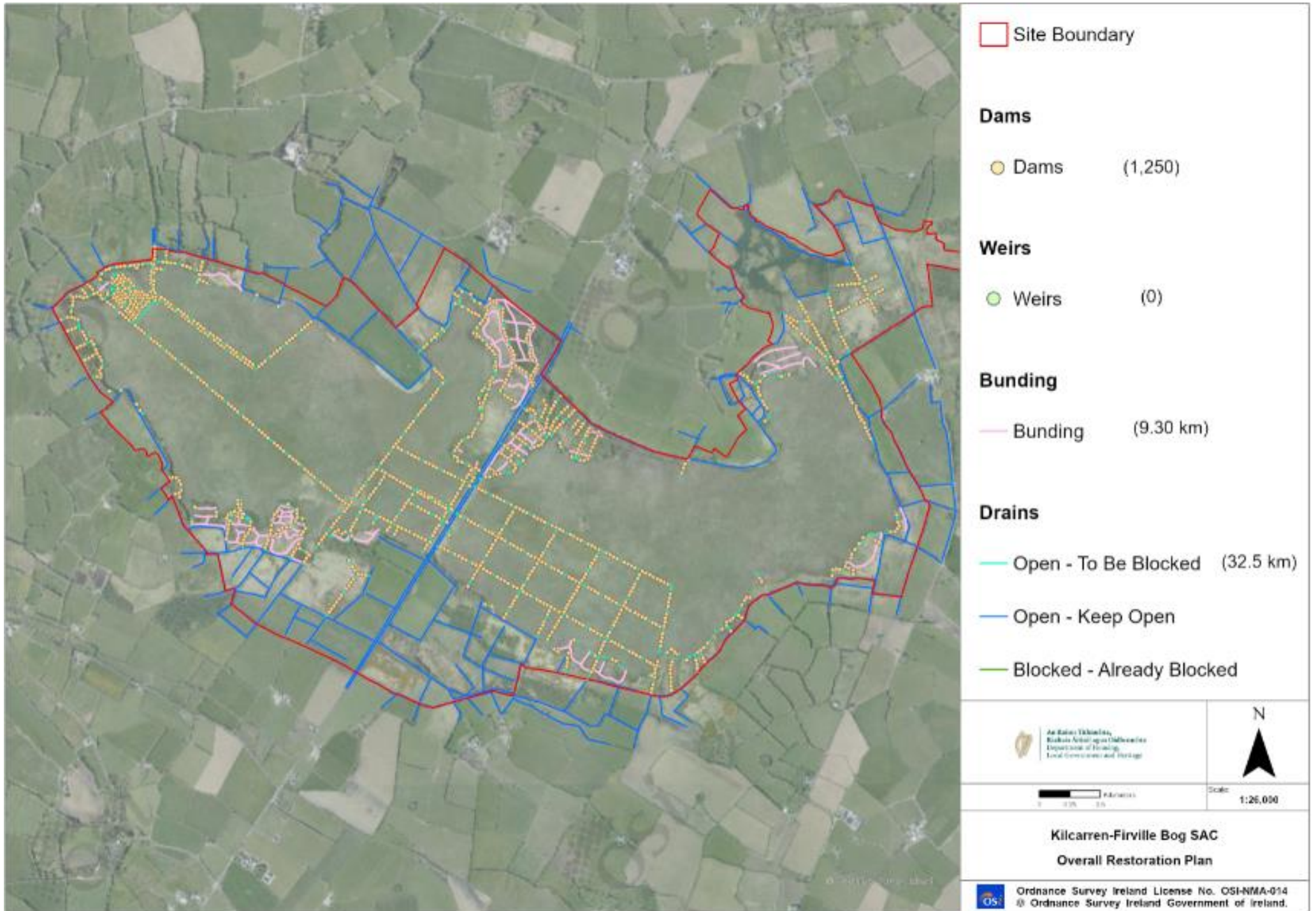
Map 2 – Kilcarren-Firville Bog SAC Restoration Proposals