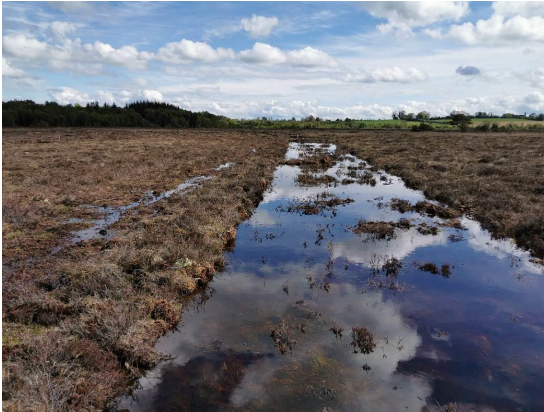
Figure 2.4 Example of contour bund constructed at Knockacoller Bog SAC, Co. Laois

Contour bunds are most effective where there is cracking or slumping in the upper layers of the peat as the re-compacted trench assists in sealing up these cracks and slows the flow rate through the peat, supporting a higher water table behind the bund. The key issue with this technique is that the extent of the impact extending back into the bog depends on the hydraulic gradient (which is closely correlated to surface slope). As a result, the extent of impact from such bunds is likely to be extremely limited where the surface slope at the margins is steep. This method is best suited to sites with a relatively gentle slope towards the margins or as a means of effectively blocking a dense network of shallow surface drains on the high bog. Ground conditions will play an important factor in whether the bund can be constructed in such circumstances, therefore this method is most effective on drier sites where machines can operate safely and effectively.