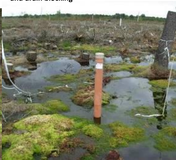
Figure 2.3 Example of the impact of felling forestry on a raised bog to restore more natural hydrological conditions