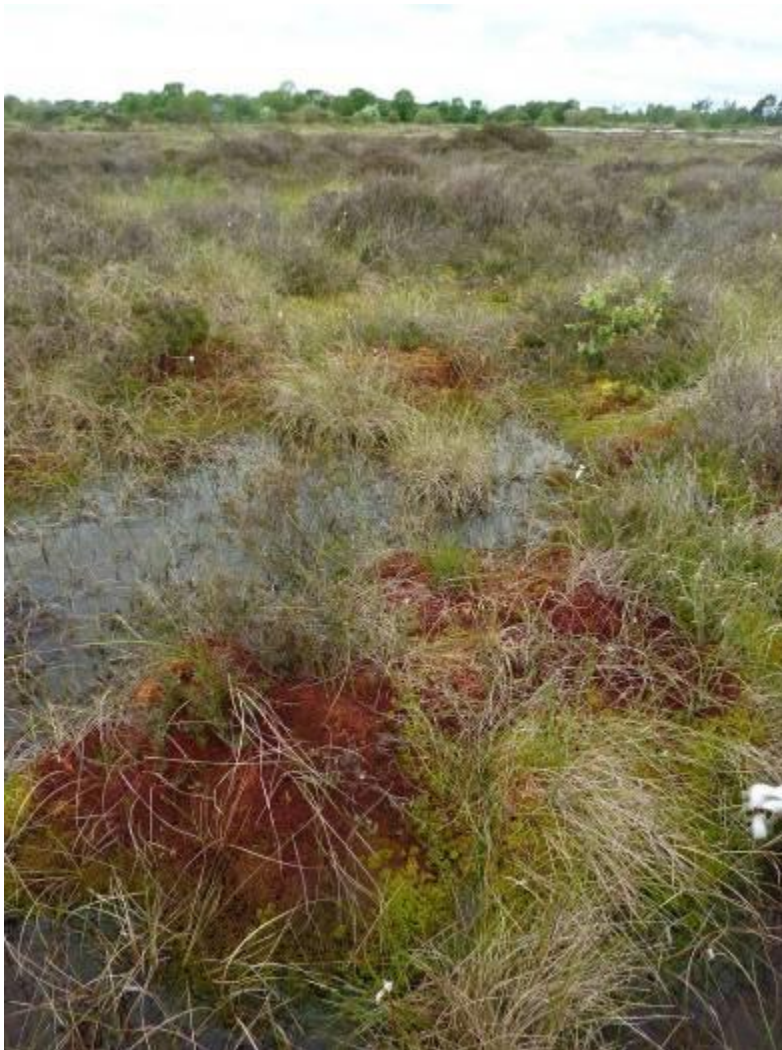
Figure 2.2 Water table at the surface of cutover bog following successful drain blocking resulting in Sphagnum development less than 10 years after drain blocking (this was previously an area of bare peat)