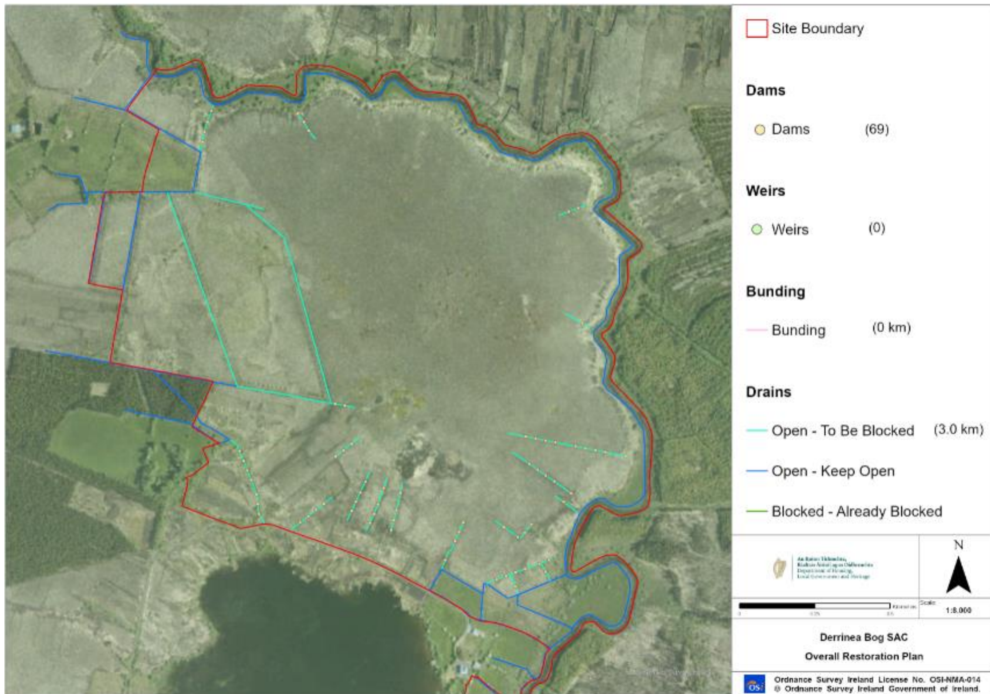
Map 2 - Derrinea Bog SAC Restoration Proposals