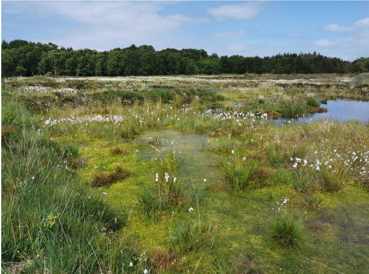
Figure 2.4 Example of existing cell bund constructed at Cloncrow Bog NHA

Cell bunds are typically constructed by excavating a trench 1.0-1.5m deep, recompacting the excavated peat into the trench and constructing a bund 0.5-0.6m high above the ground surface (Figure 2.3). Water level control structures (pipes or overflow weirs) are incorporated into these cells as a means to regulate water levels and evenly distribute water across the site.