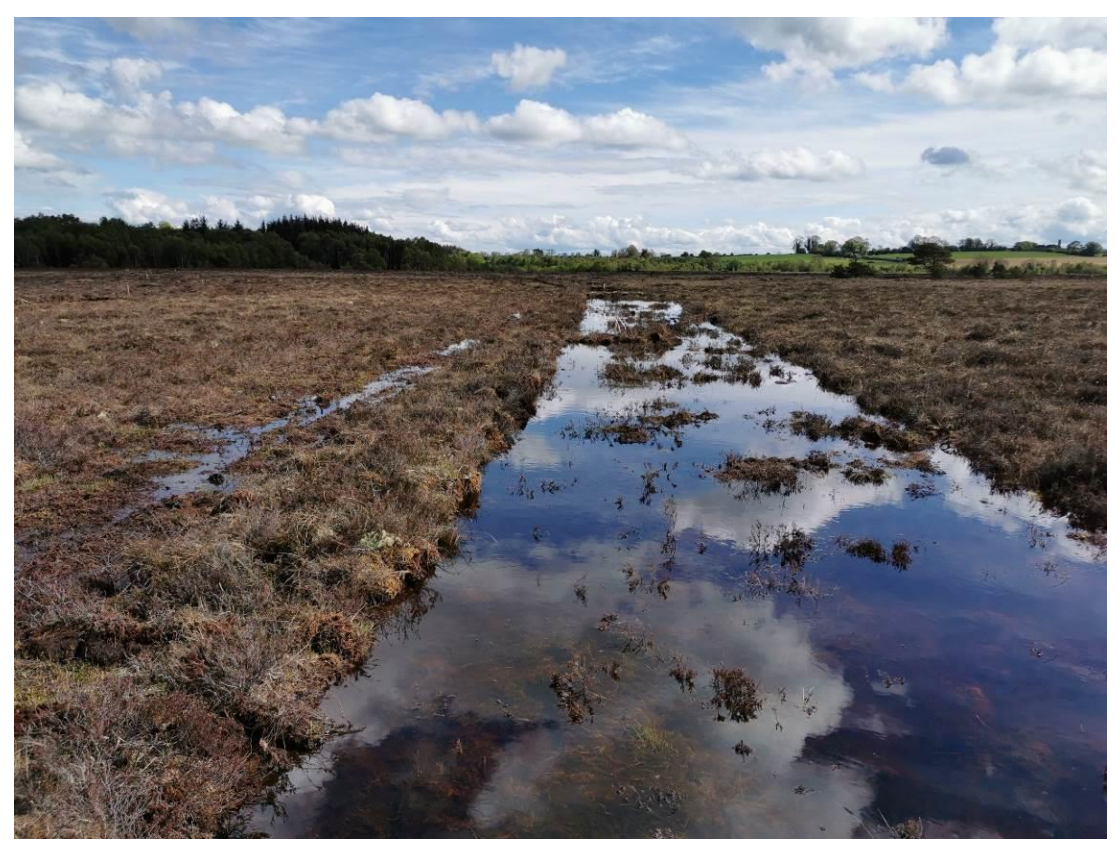
Figure 2.3 Example of contour bund constructed at Knockacoller Bog SAC, Co. Laois

After 1-2 years it is anticipated that the bund will have subsided close to current ground level and therefore will not appear as a prominent feature on the bog surface.