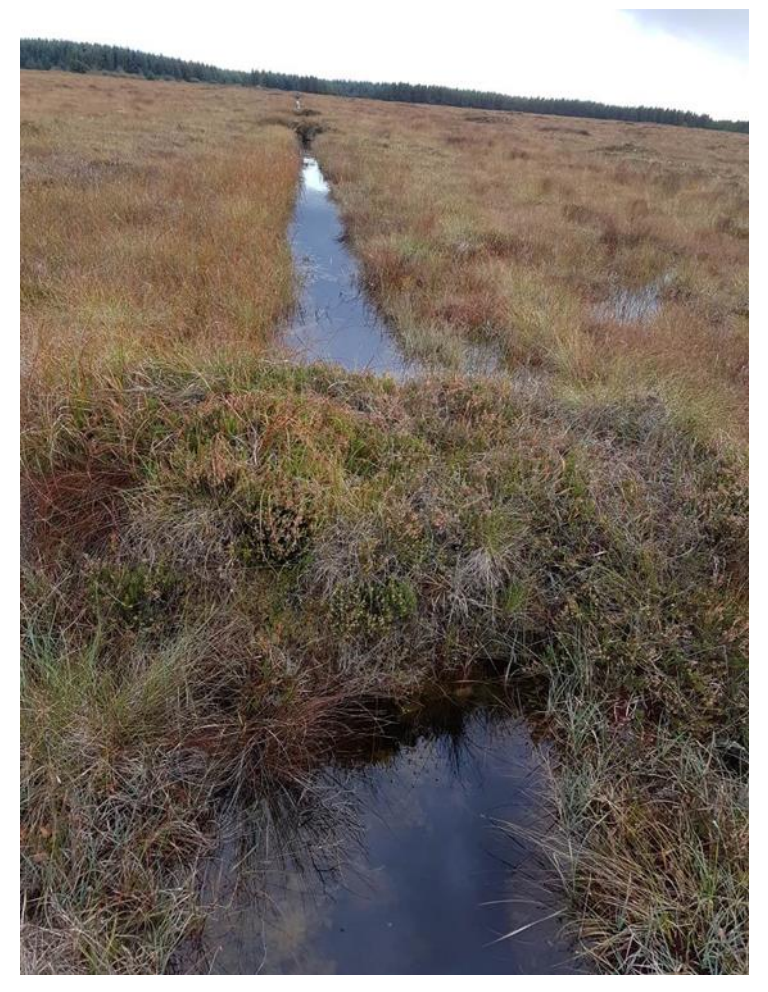
Figure 2.1 Example of a peat dam to block a typical high bog drain.