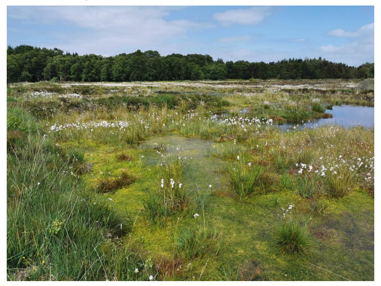
Figure 2.4 Example of existing cell bund constructed at Cloncrow Bog NHA

Cell bunds are typically constucted by excavating a trench 1.0-1.5m deep, recompacting the excavated peat into the trench and constucting a bund 0.5-0.6m high above the ground surface (Figure 2.3). Water level control structures (pipes or overflow weirs) are incorporated into these cells as a means to regulate water levels and evenly distribute water across the site.