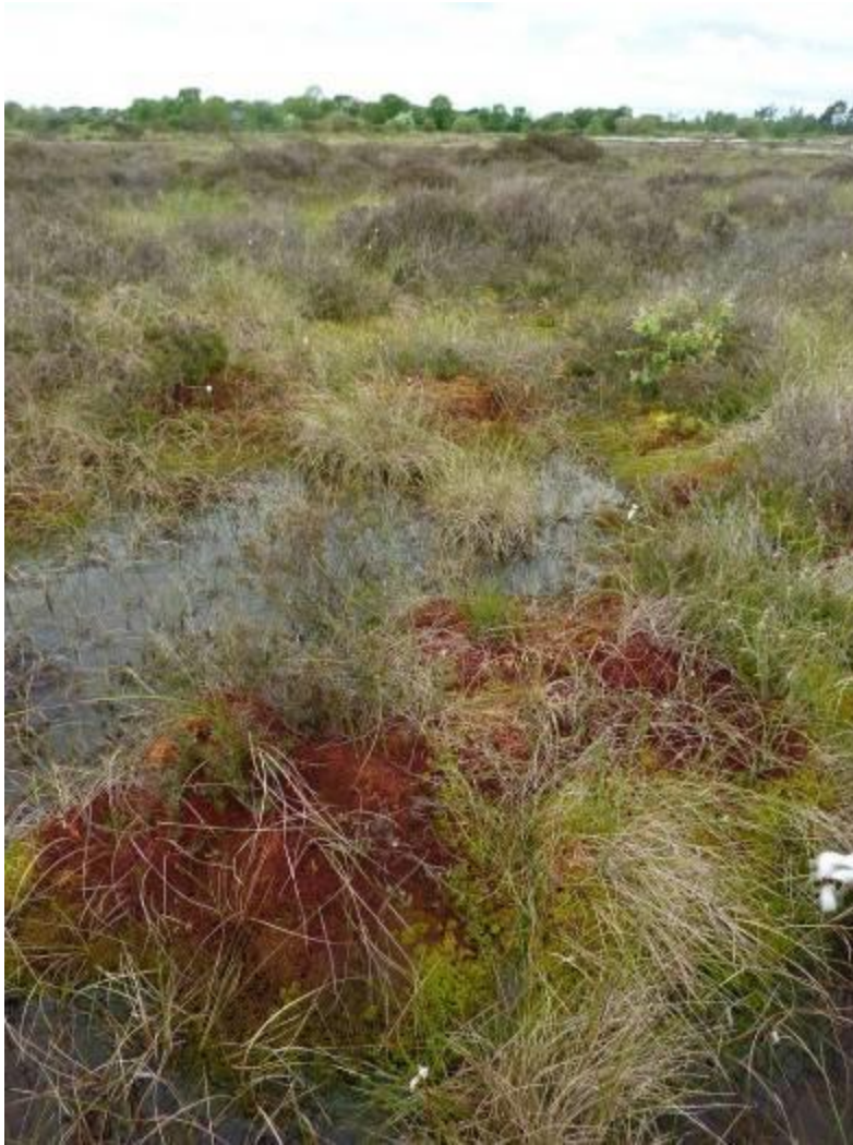
Figure 2.2 Water table at the surface of cutover bog following successful drain blocking resulting in Sphagnum development less than 10 years after drain blocking (this was previously an area of bare peat)