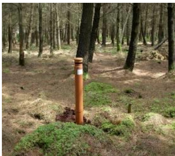
a) Bog surface prior to forestry removal and drain blocking