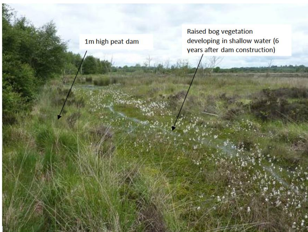
Figure 2.4 Photo illustrating very shallow area of water (<20cm deep) being held behind a 1m high marginal dam

It is proposed that a 233m long marginal dam is constructed on the cutover of Coolrain Bog SAC. The cutover in this area is relatively flat and there is potential to re-wet a large area behind the dam. Weirs will be included in the dam to ensure that water levels do not rise significantly. Details of the locations of the proposed marginal dam can be found in Map 3.