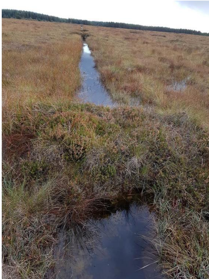
Figure 2.1 Example of a peat dam to block a typical high bog drain.

There are relatively few functional drains on Coolrain Bog. It is proposed that all remaining unblocked drains on the high bog surface of Coolrain Bog are blocked with peat dams. Details of the locations of unblocked drains on the high bog can be found in Map 2.