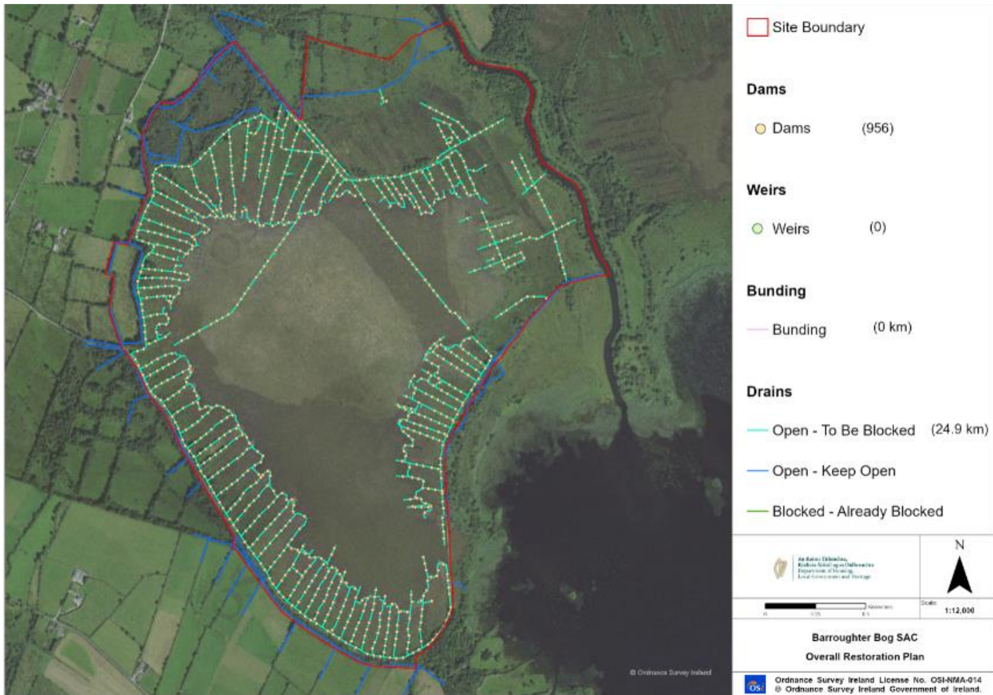
Map 2 - Barroughter Bog SAC Restoration Proposals