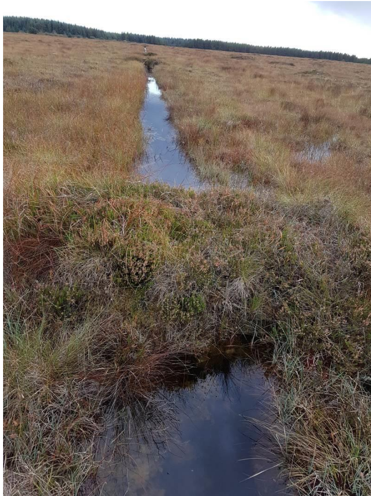
Figure 2.1 Example of a peat dam used to block a typical high bog drain.

There are relatively few functional drains on Barroughter Bog. It is proposed that all remaining unblocked drains on the high bog surface are blocked with peat dams. Details of the locations of unblocked drains on the high bog can be found in Map 2.