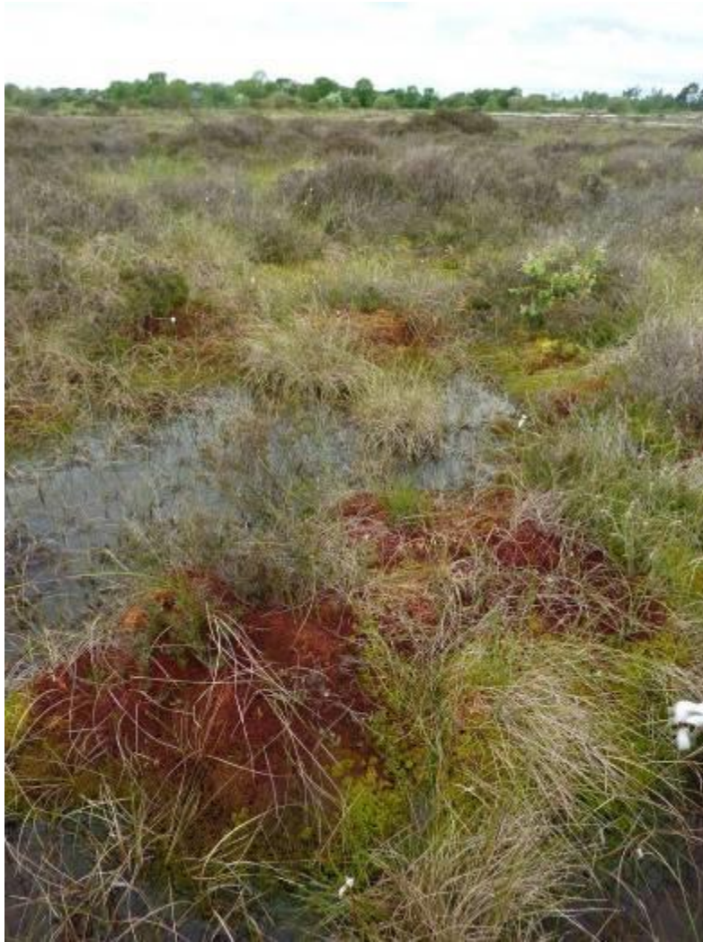
Figure 2.2 Water table at the surface of cutover bog following successful drain blocking resulting in Sphagnum development less than 10 years after drain blocking (this was previously an area of bare peat)

There are several cutover areas surrounding the bog where blocking of drains may reduce ongoing subsidence of the high bog. In some areas this will also lead to the development of peat forming habitats. It is proposed that these drains are blocked, primarily with peat dams, with some plastic reinforcements where necessary to prevent erosion. The required conditions are for the water table to be maintained at or close to the surface, therefore large areas of standing water or deep pools are not desired. Details of the locations on the cutover where it is proposed to block drains can be found in Map 2.