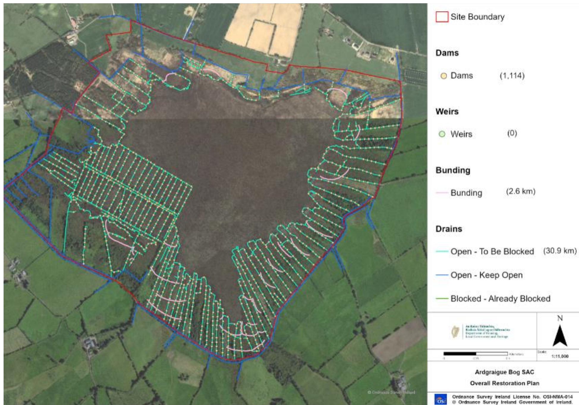
Map 2 - Ardgraique Bog SAC Restoration Proposals