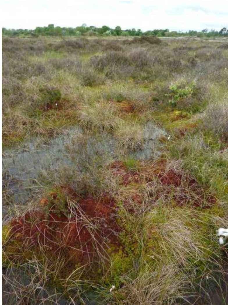
Figure 2.2 Water table at the surface of cutover bog following successful drain blocking resulting in Sphagnum development less than 10 years after drain blocking (this was previously an area of bare peat)

suitable hydrological barrier such as a functional drain to prevent impacts outside of the restoration area.