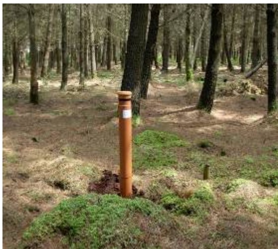
a) Bog surface prior to forestry removal and drain blocking