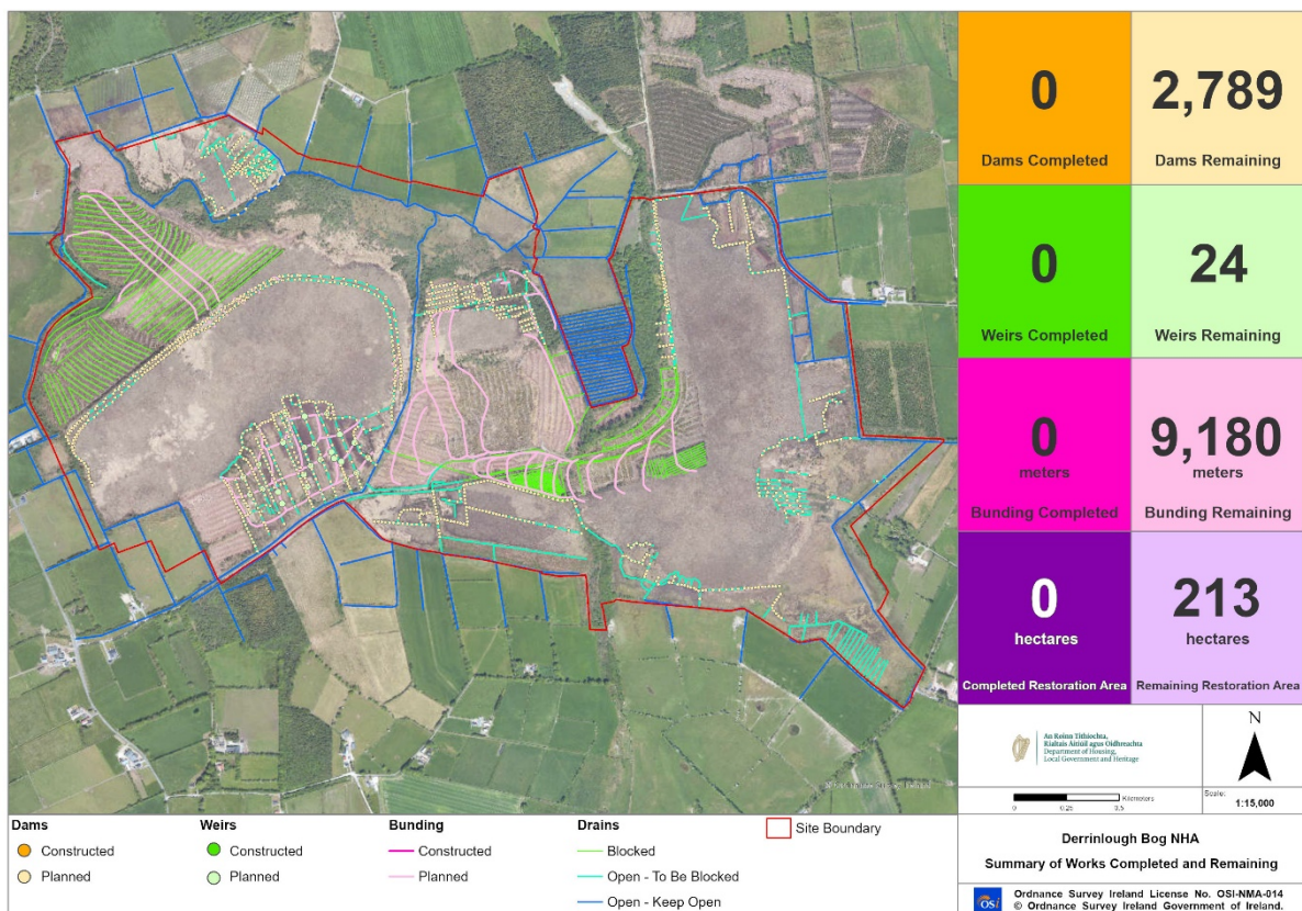
Figure 5.4 Summary of works remaining

It is envisaged that the construction phase of the proposed restoration measures will commence in 2023. It is envisaged that over 6km of contour bunding and over 2km of trench bunding will be installed with almost 3,000 peat dams to be constructed.