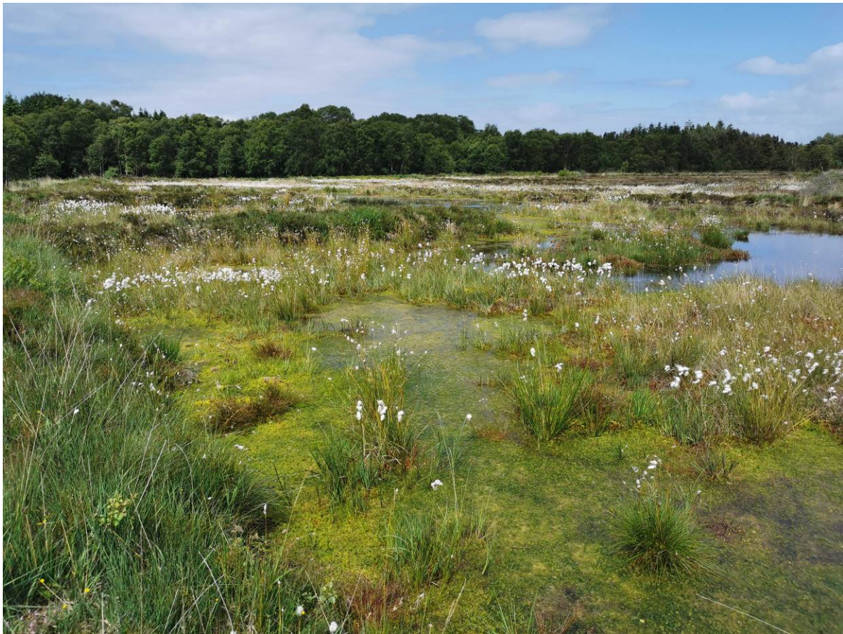
Figure 2.5 Example of existing cell bund constructed at Cloncrow Bog NHA (the vegetation in this photo has developed in the 2 years since cell construction)

Cell bunds are typically constructed by excavating a trench 1.0-1.5m deep, recompacting the excavated peat into the trench and constructing a bund 0.5-0.6m high above the ground surface (Figure 2.3). Water level control structures (pipes or overflow weirs) are incorporated into these cells as a means to regulate water levels and evenly distribute water across the site.