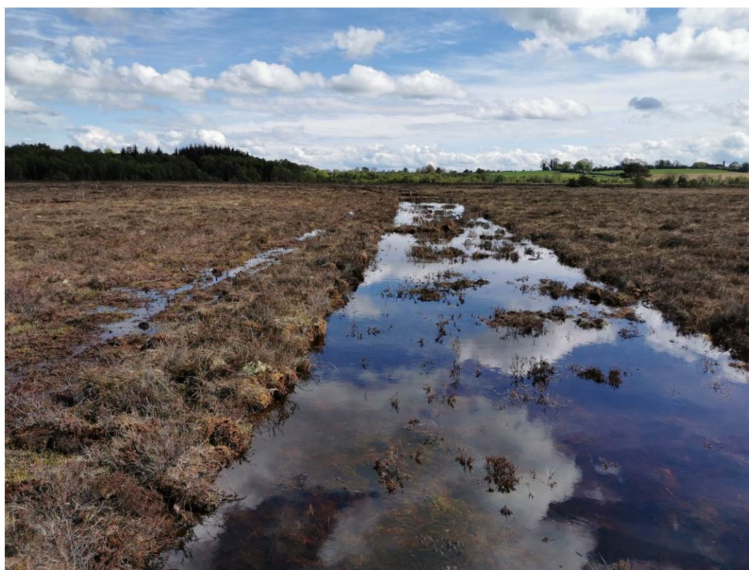
Figure 2.4 Example of typical contour bund constructed at Knockacoller Bog SAC, Co. Laois

therefore will not appear as a prominent feature on the bog surface.