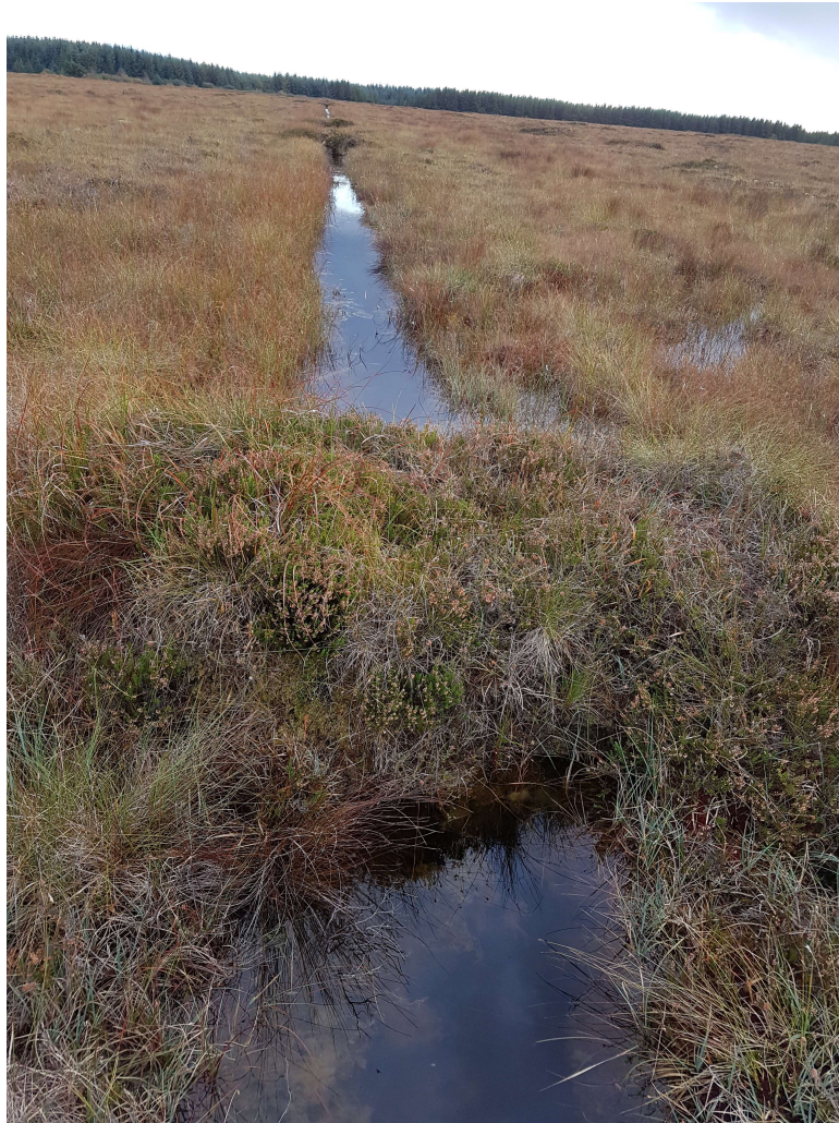
Figure 2.1 Overgrown peat dams showing water table at the ground surface

Extensive restoration has already been carried out within the site. The drains that have been blocked are no longer functioning. However, there are a small number of functional drains on the remainder of the high bog. It is proposed that all remaining unblocked drains on the high bog surface are blocked with peat dams. Details of the locations of unblocked drains on the high bog can be found in Map 2.