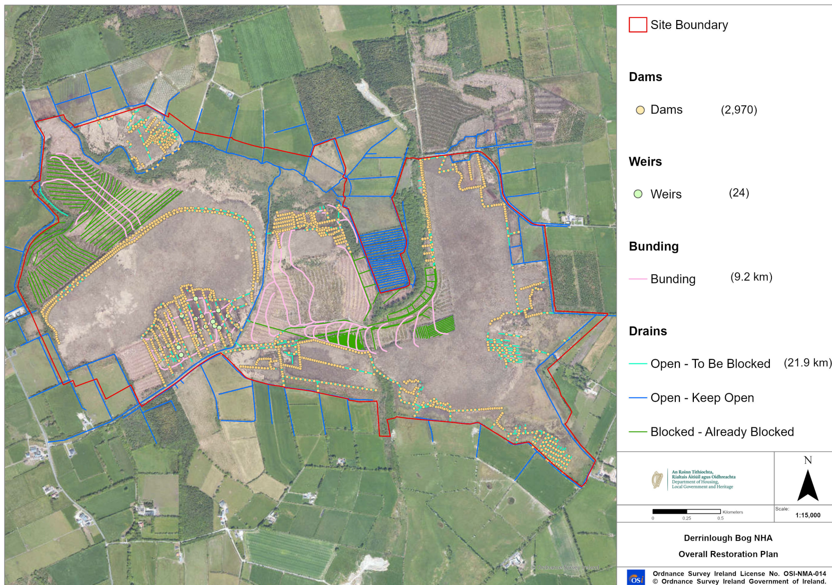
Map 2 - Restoration Proposals