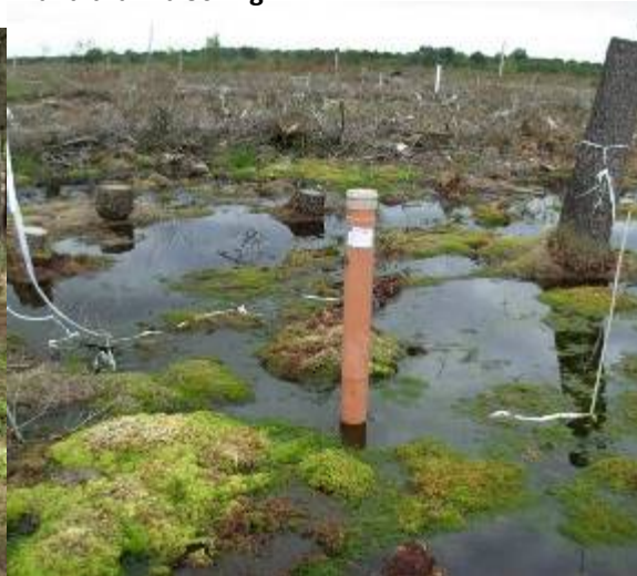
Figure 2.3 Example of the impact of felling forestry on a raised bog to restore more natural hydrological conditions