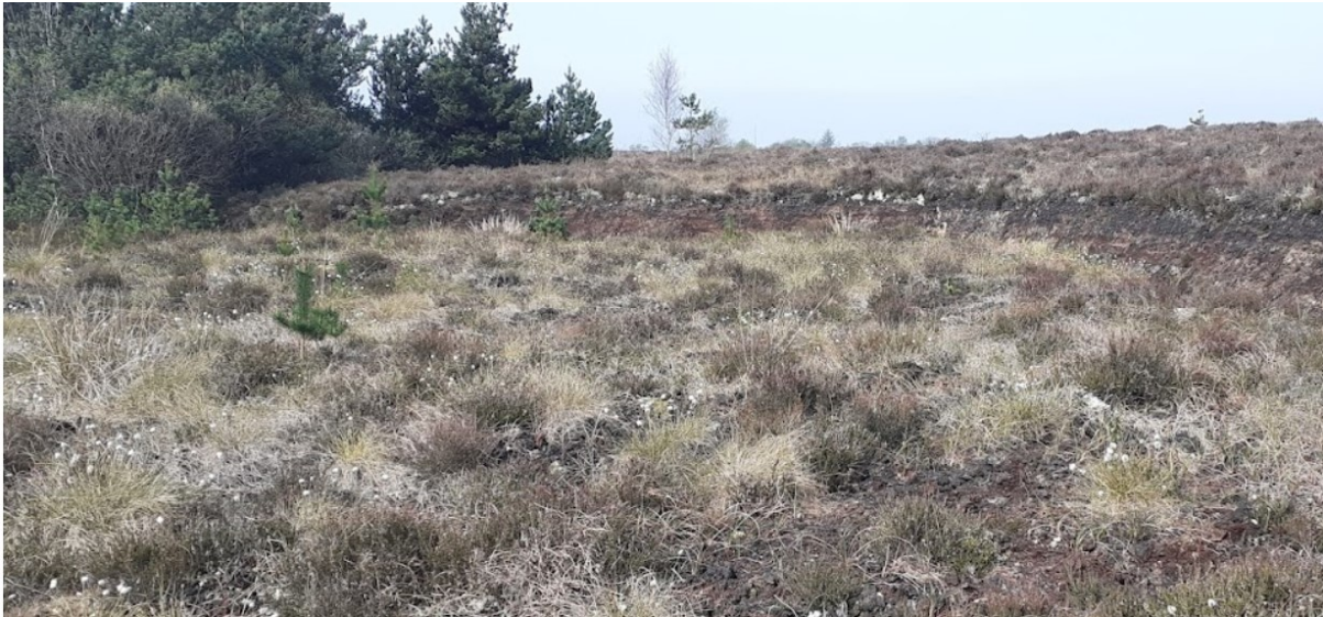
Figure 5.3 Proposed cell-bunding area in southwest o bog